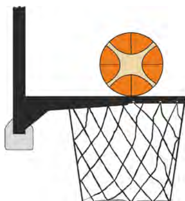
Diagram 2 Ball in contact with the ring

31-15 Statement. Interference is committed by a defensive or offensive player during a shot for a field goal when a player touches the basket or the backboard while the ball is in contact with the ring and still has a possibility to enter the basket.